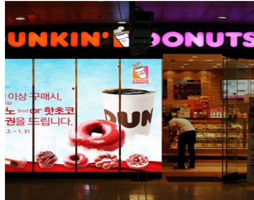
• Road Shop Eye Catching