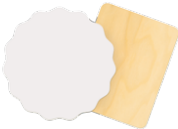
KATZ FOOD SAFETY BOARD

KATZ special materials constitute a genuine alternative raw material for industry. Our wood pulp-based material has won widespread acclaim for its eco-friendliness, low weight, easily converted and wide range of applications.