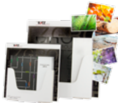
TENT CARDS & COUNTER DISPLAY UNITS