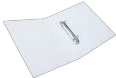
KATZ ECO OFFICE