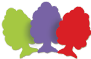
KATZ AIRFRESHENER BOARD