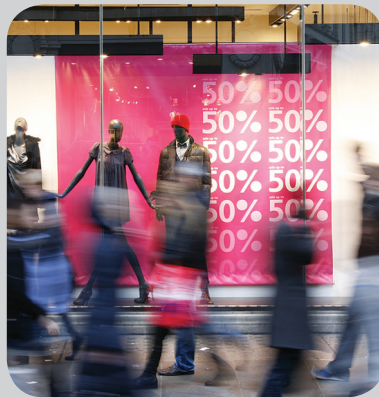
In-store POS display