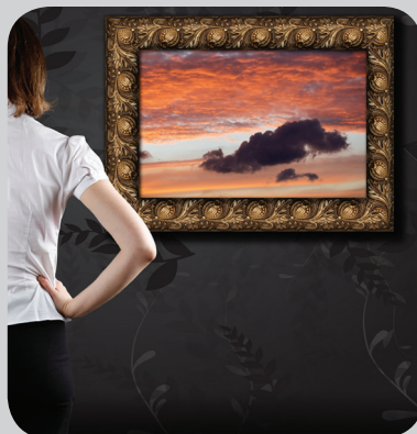
High quality prints and posters