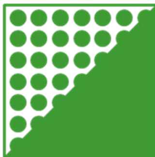
ORAFLEX® 11403 medium