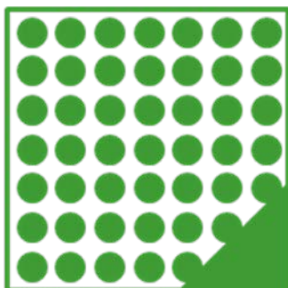
ORAFLEX® 11402 soft