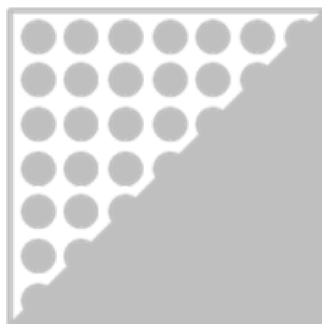
ORAFLEX® 11403 medium